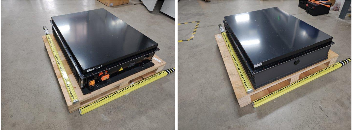
电池组/ Battery (ECO-P1P48LP 153,6V 314Ah 48,23kWh)