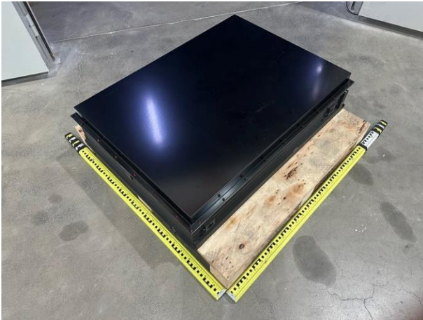
电池模块/ Battery Module (ECO-P1P52LP 166,4V 314Ah 52,249kWh)